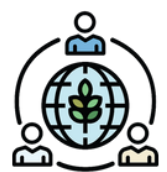
Market Development and Access